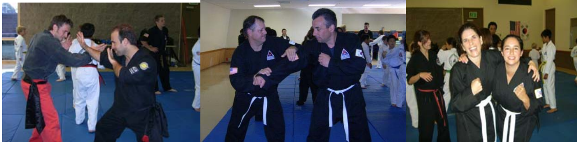
Inst. Klockner & Inst. Pinto