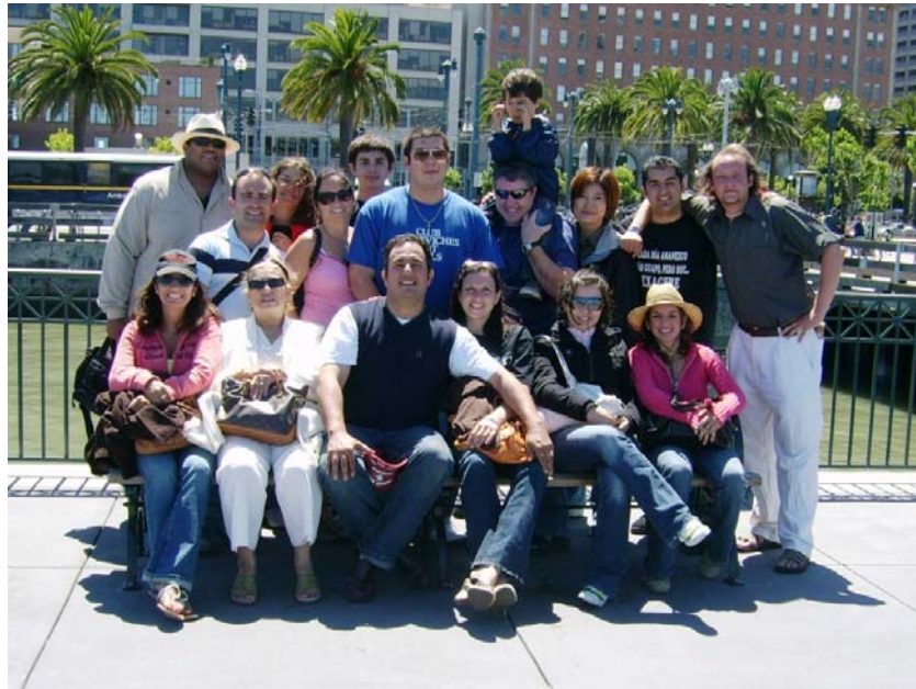
Photo Group of Cruise Team