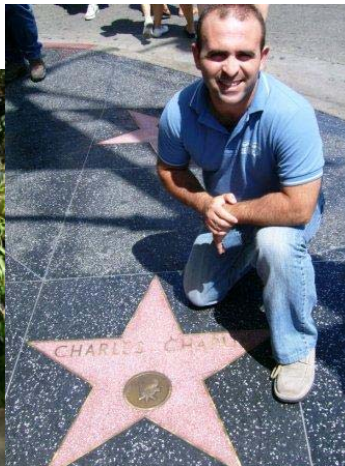
Walk of Fama in Hollywood