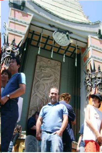
SBN Pinto- Chinese Theater in Hollywood