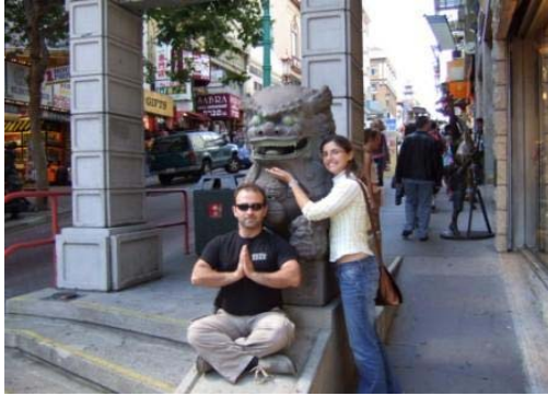
Chinatown of SF, where Bruce Lee was born.