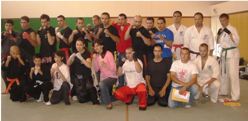
Photo Group of the Tournament: Farang Mu Sul, Kempo, Karaté Kiunshikai, Kung-Fu & Kickboxing.