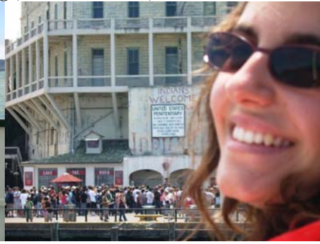
Vera, Photo back view of Alcatraz Prison