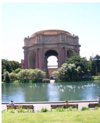
Palace of Fine Arts